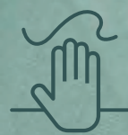
A feeling of bulge