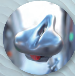
[ Bicycle seat ]