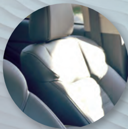
[ Car seat ]