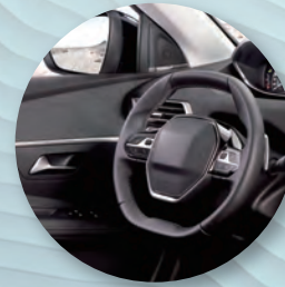
[ Steering wheel ]